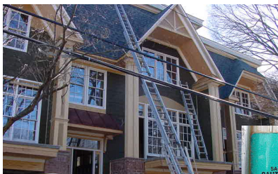
A painter was electrocuted when moving a metal ladder on this jobsite.

Aluminum is an excellent conductor of electricity. Working around wiring? Fiberglass is a better choice.